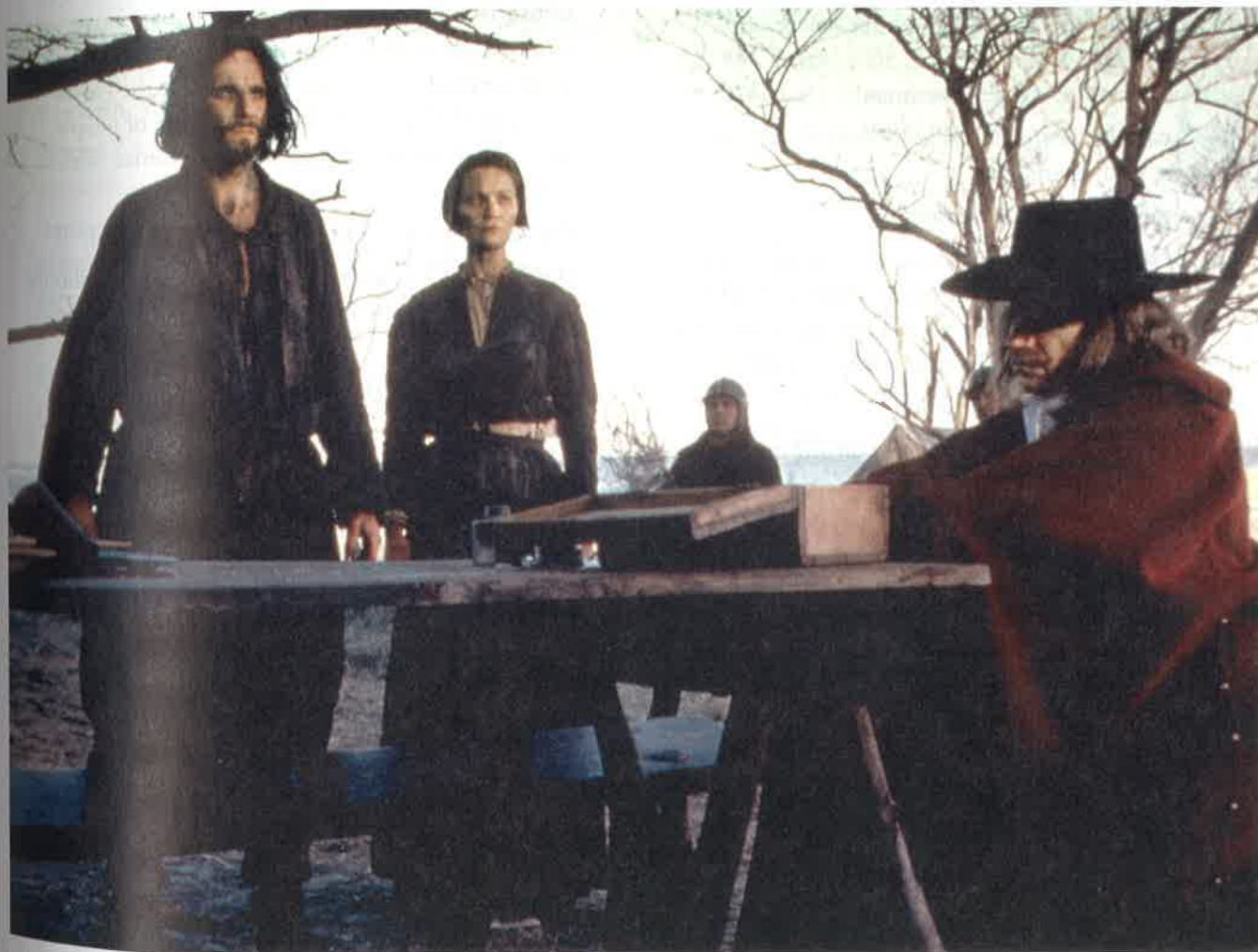
John and Elizabeth Proctor before the marshal

Parris ( runs to the door and calls down the corridor ). Marshal! Hurry!