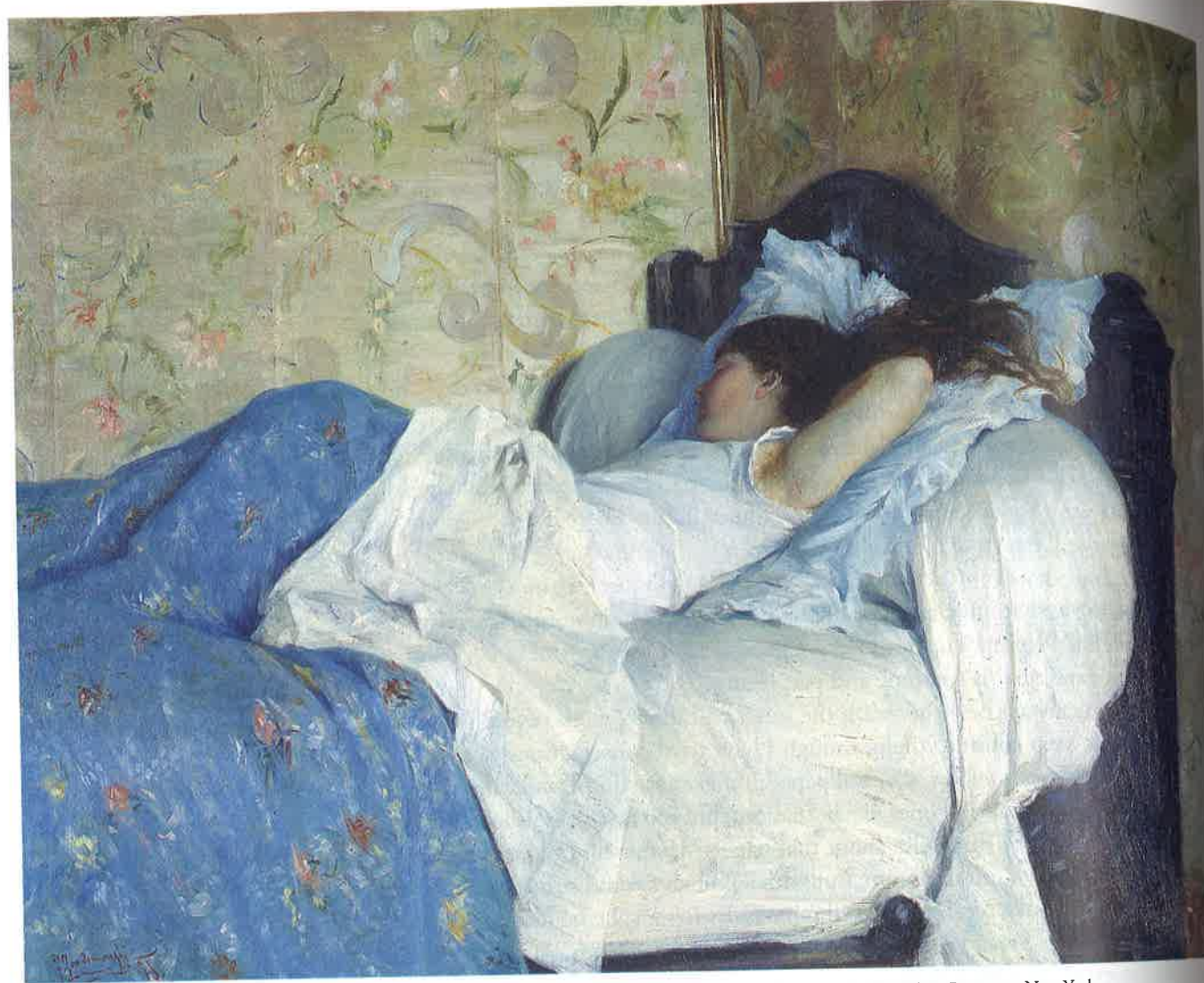
In Bed (1878), Federico Zandomenighi. Oil on canvas, 60.5 cm x 73.5 cm. Galleria d'Arte Moderna, Florence.

But now I am used to it. The only thing I can think of that it is like is the color of the paper! A yellow smell. K